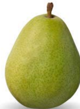
Firmer fruit is preferred by many packers